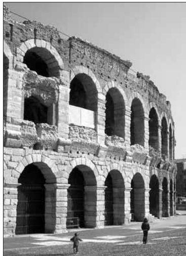
Verona's Roman arena is the site of many musical events including operas.

As the town of Pozzoleone is small, so expect crowds in the area and parking problems.