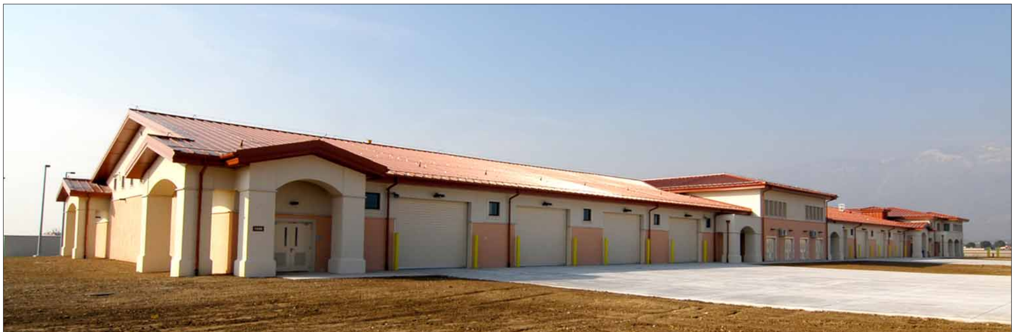
The new Personnel Alert Holding Area building is located on the apron of the south ramp on Aviano airfield, leaving departing Soldiers just steps from their awaiting aircraft.

Much better than what they have now." The official opening for the new PAHA is scheduled for Feb. 25 at 3 p.m.