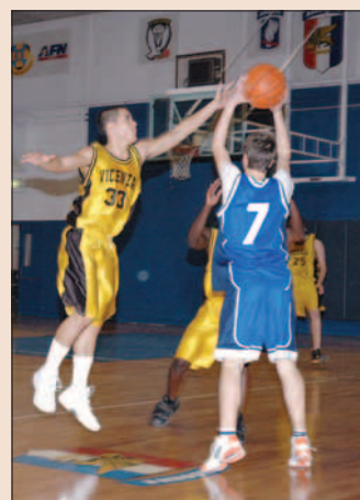
Cougars take on local Italians