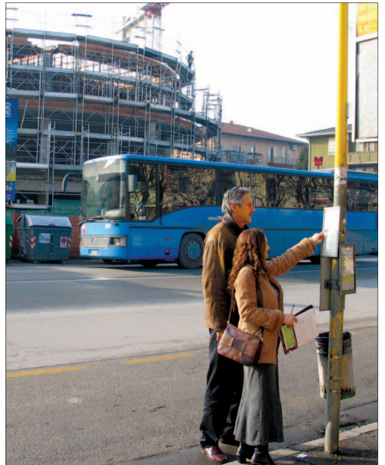
Bus schedules are posted at all bus stops along the route.

When you come back from downtown by bus, your stop for Caserma Ederle will be the first one after the AGIP gas station and the traffic circle. When you come back